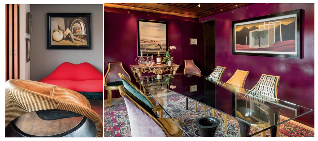
Interior views of the collector's home

London – Christie's will offer The Landscape of a Mind: A Private Collector's Surreal Vision as a highlight of '20<sup>th</sup> Century at Christie's'. Over a series of sales, including the Impressionist and Modern Art Evening Sale on 18 June, and a dedicated sale of Design, Photography, Indian Miniatures, Post-War and Contemporary Art and further Impressionist and Modern Art on 20 June, more than 100 works will be presented. Together, they map the surreal vision of an eclectic collector who cleverly created a dialogue between objects and artworks in the domestic settings they inhabited. The collection is estimated in the region of £15,000,000.